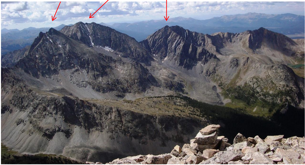
View from the summit: The Three Apostles, three thirteeners that can be climbed from Huron, but it's a very long day featuring some route finding and Class 4 climbing.