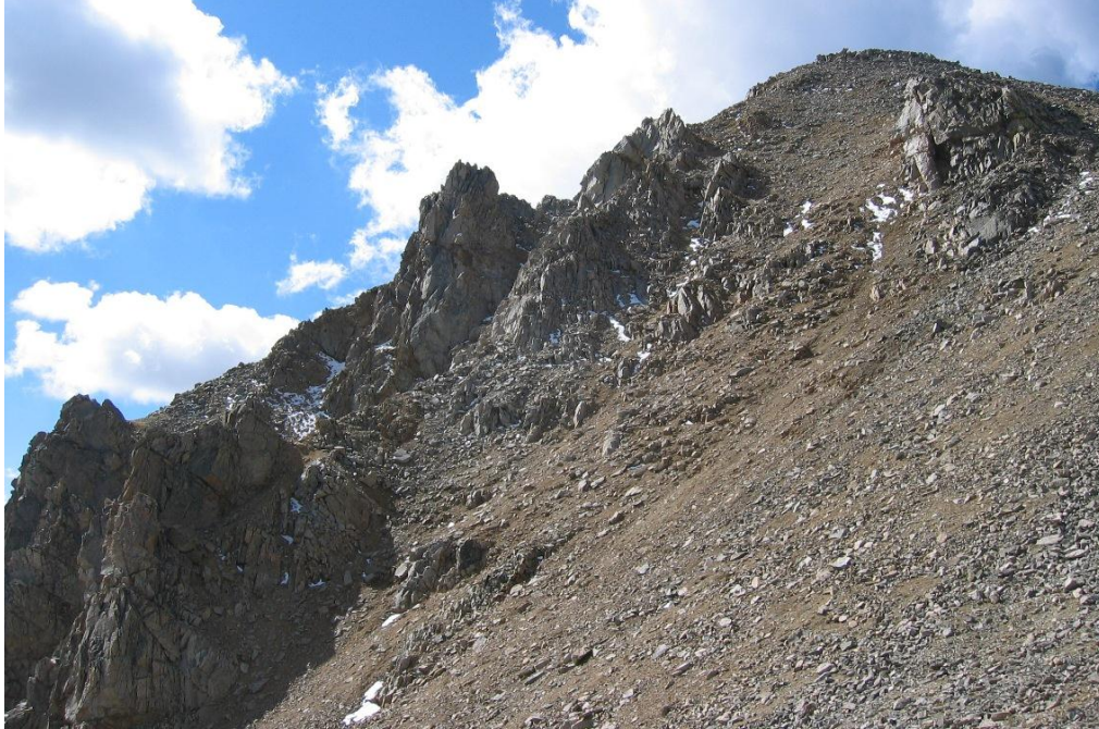
Final pitch to the summit – some easy Class 2 rock hopping mixed with scree.