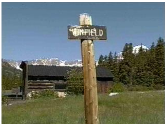
The town of Winfield

Winfield is a ghost town with a half dozen buildings left, some of which have been partially restored. Silver mining is what started Winfield, which hit its stride briefly by 1881. It actually went through several names, like Lucknow and Florence. At its peak, the town had 1500 residents, three saloons, three stores, two hotels, a boarding house, a church and a school.