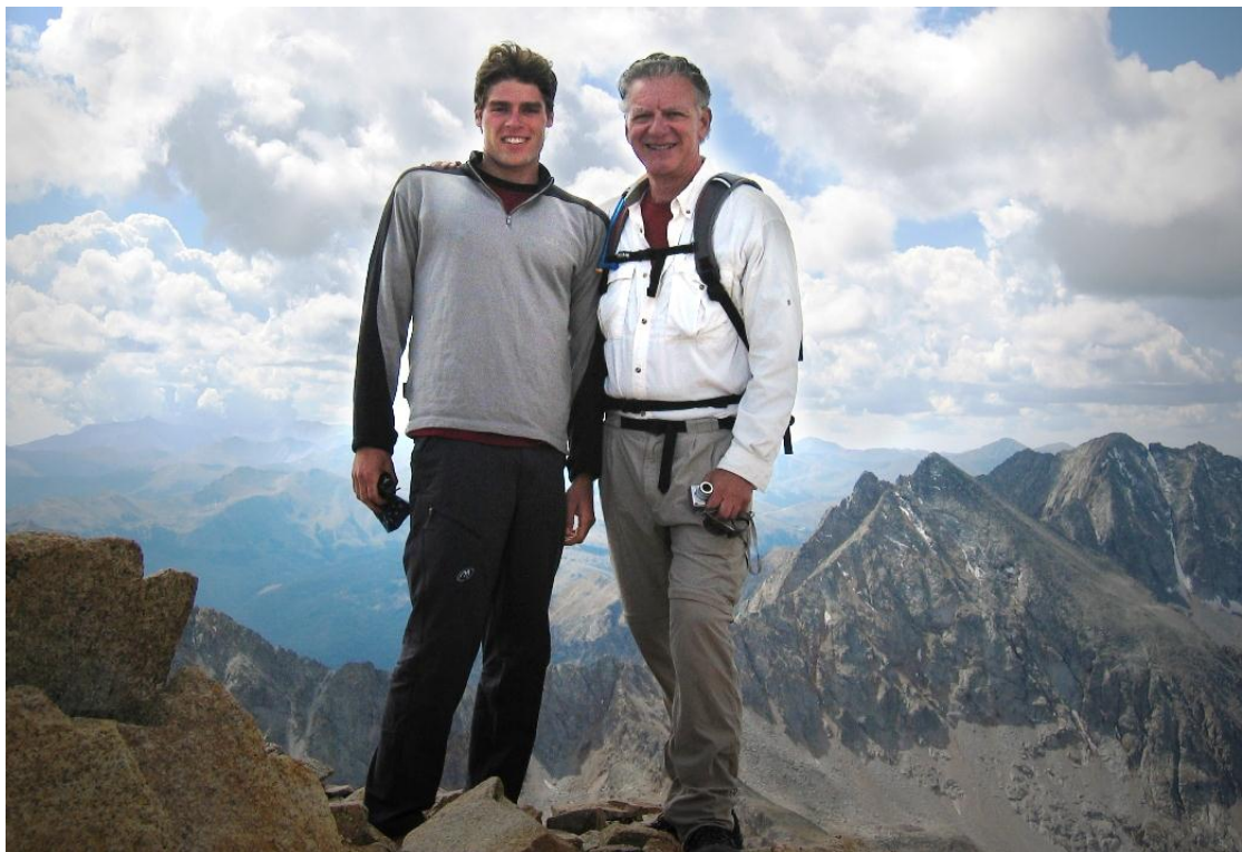
Summit: Huron Peak 14,010' 11:15 am, 3 hours from trailhead.