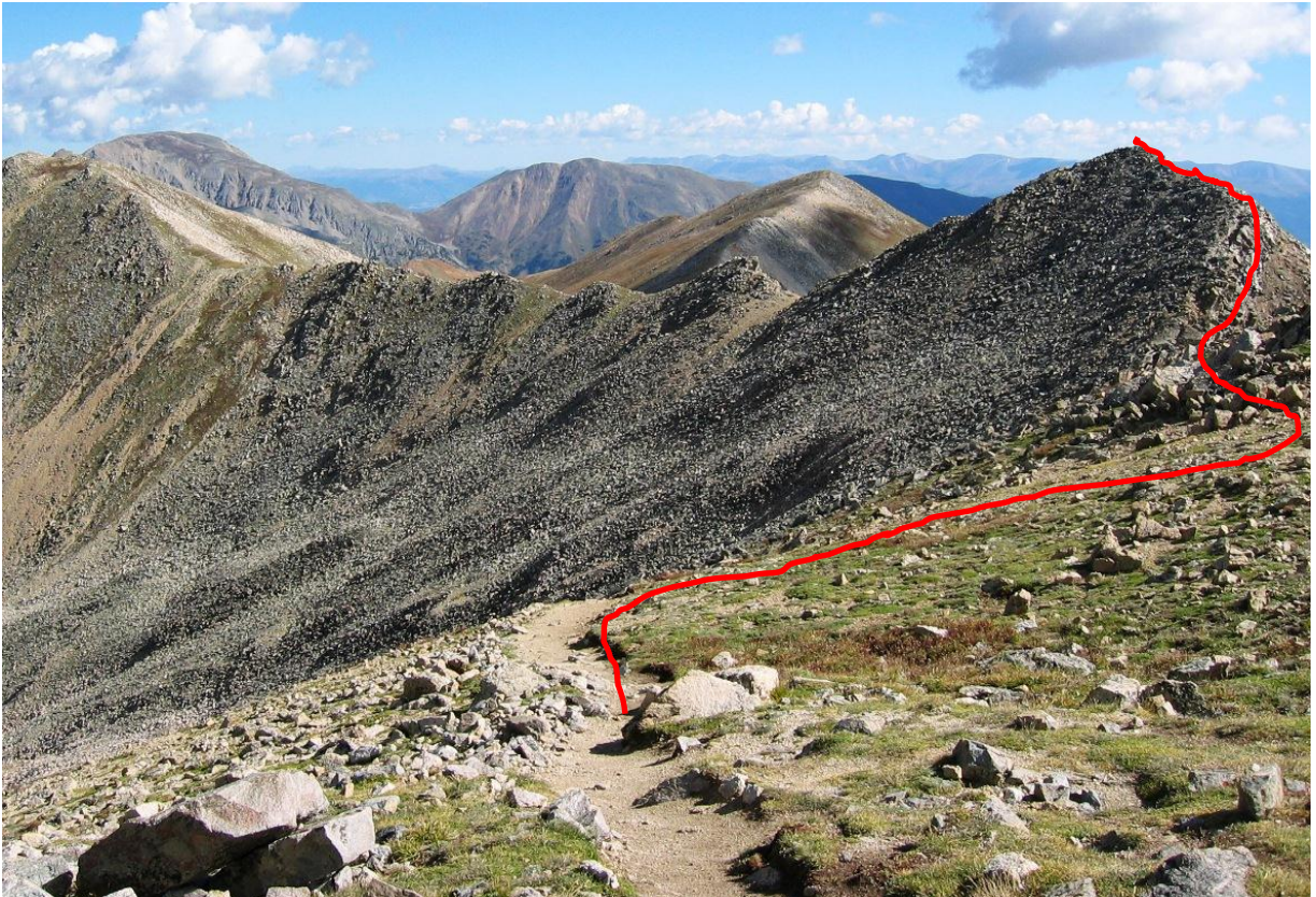
At 13,400' with the remaining route to summit in view.