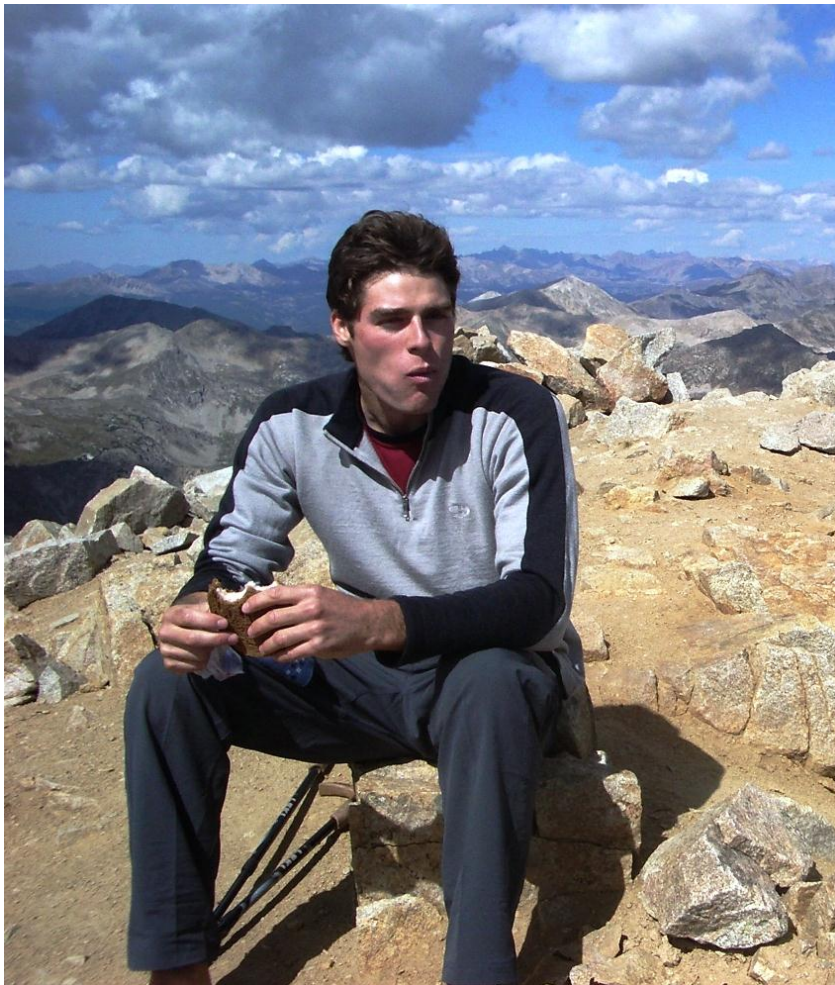
View from the summit: The Three Apostles, three thirteeners that can be climbed from Huron, but it's a very long day featuring some route finding and Class 4 climbing.